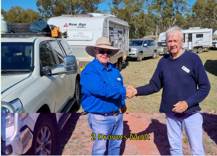
2 Drivers Meet